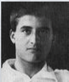
BLESSED PIER GIORGIO FRASSATI

academic centers, laboratories and recreation homes in Italy and abroad. St. John Bosco is known as the patron saint of apprentices, boys, editors, Mexican youth, laborers, schoolchildren, and young people in general. Next, we visit Piazza San Carlo, Po Street, and Mount of the Capuchin Monks . From there, we return to our hotel in Milan for dinner and overnight. [B,D]